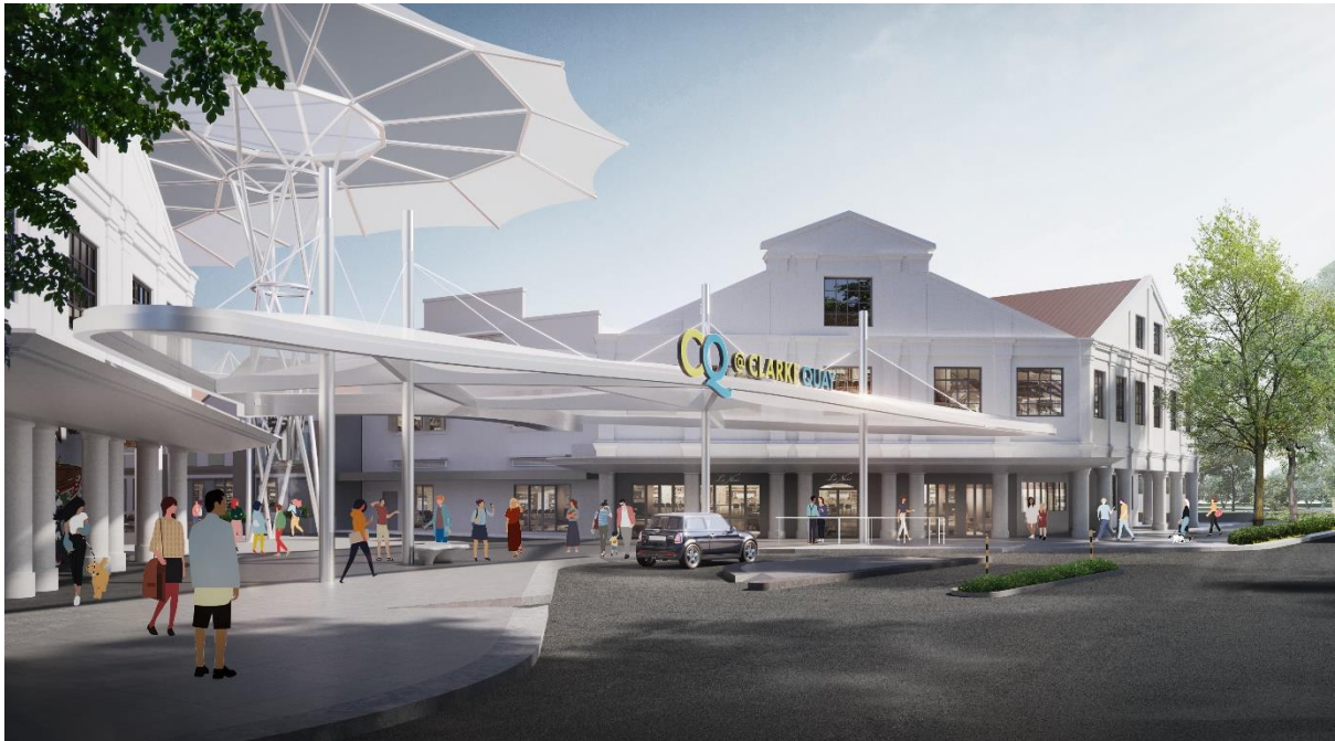
Image 1 – The property façade of Block B will be given a new paint of heritage colours, which reference historical palettes and highlight the characteristics of the reinstated godown typology. This is a view of the revamped CQ @ Clarke Quay from River Valley Road.