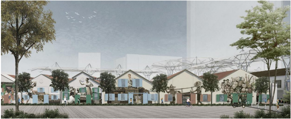
Image 5 – As part of the creative placemaking effort of CQ @ Clarke Quay, the refreshed property façade at Tan Tye Place will be adorned with vibrant murals that celebrate life in the area.