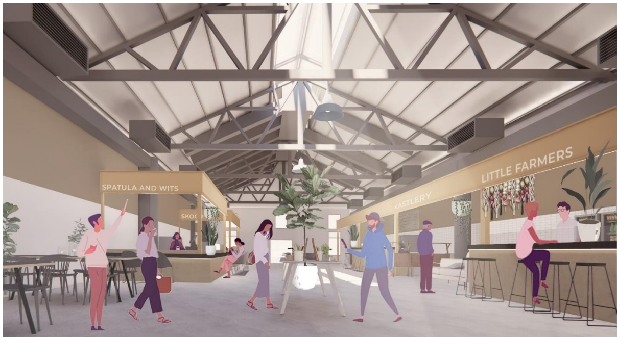
Image 4 – The revamped CQ @ Clarke Quay will introduce more retail and lifestyle tenants that maximise the reinstated godown typology of the conserved warehouses at Block B. This is an interior view of a heritage warehouse unit with skylight.