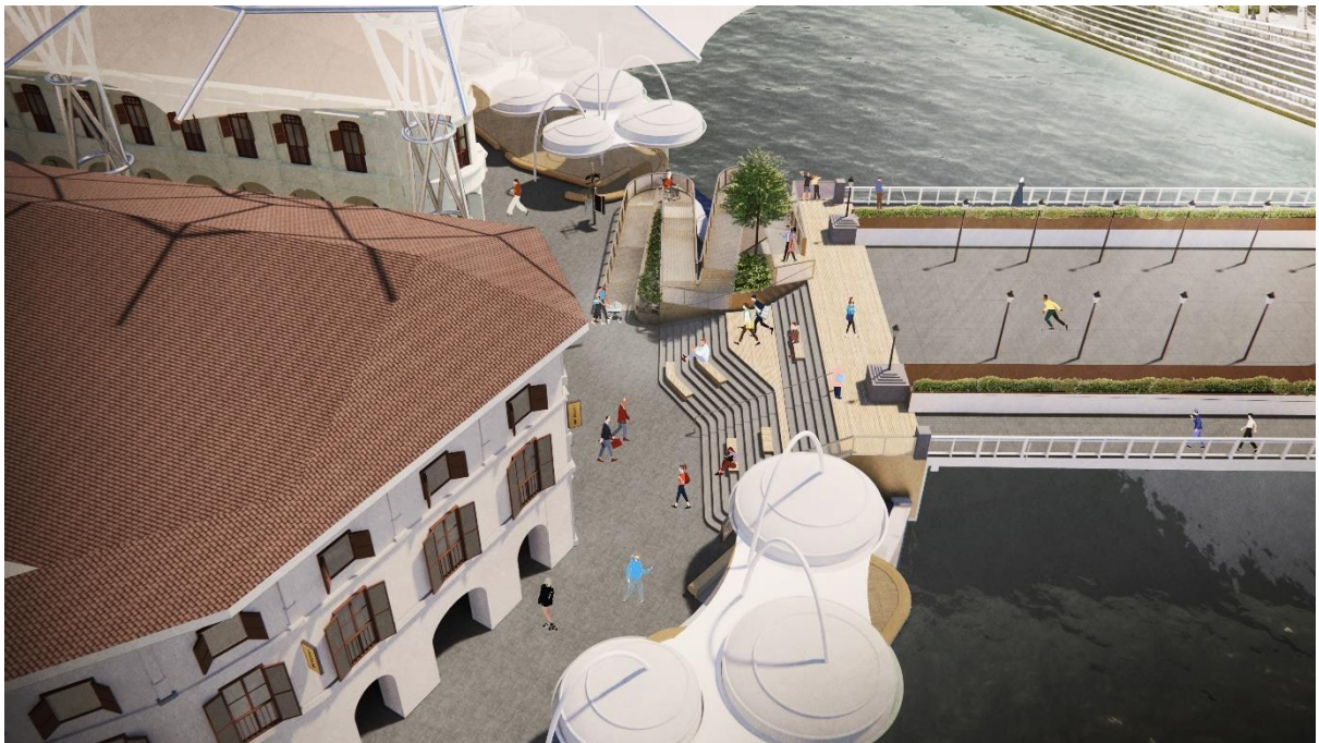
Image 6 – In a nod to Read Bridge's past as a social gathering place for storytelling, upgraded steps that double up as seats will be added to the landing of Read Bridge, alongside a new accessibility ramp with lookout points, as part of the revamp of CQ @ Clarke Quay.