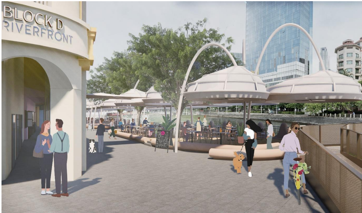
Image 3 – A view of CQ @ Clarke Quay's pet-friendly alfresco dining areas along the Singapore River.