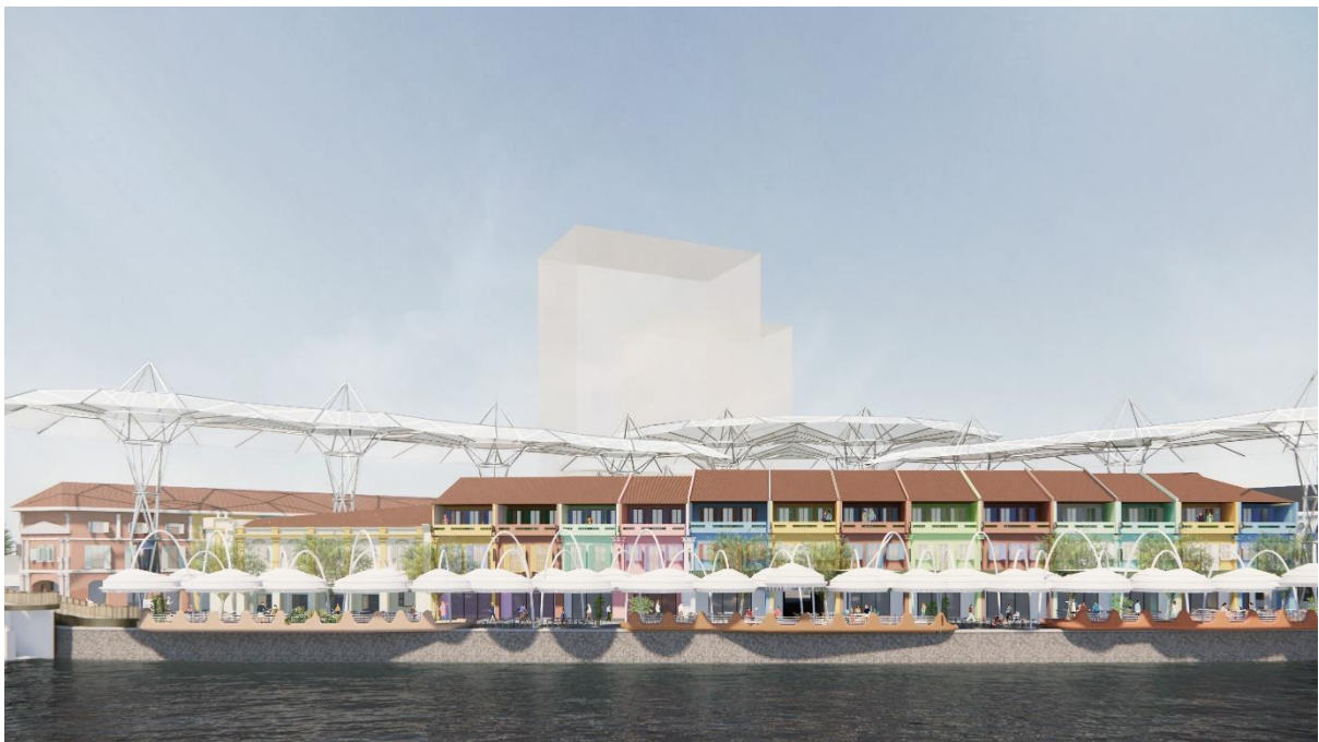
Image 2 – A view of the refreshed CQ @ Clarke Quay from the Singapore River.